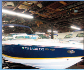
2007 Cobalt 220 – 350MAG BIII Merc, Navy (Yellow), Immaculate, TN Trailer

National Unveiling of the R3 to the public at the Nashville Boat & Sports Show This all new design on this boat is breathtaking both inside and out. The exterior profile is sleek, low, and very aggressive. The seating configuration is very universal as the passenger side seat converts into a watersports observer spot instantly. The cockpit interior is the widest interior that you have ever seen on a boat of its size – guaranteed!