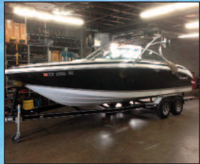
2008 Cobalt 222– 350MAG BIII, Ebony (Sand), Wakeboard Twr,etc., TN Trailer