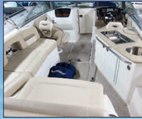
2011 Chaparral 264 Sunesta–350MAG BIII, Navy, Loaded! Only 24 hrs, TN Trailer