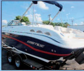
2007 Ebbtide 2660Z – 8.1 GiDP Volvo, Navy (Red), Lots of Room & Lots of Power, New 2013 TN Trailer.