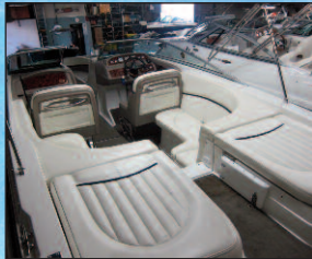
2003 Cobalt 262– 496MAG BIII, White/Navy, Loaded w. Opt., New TN Trailer