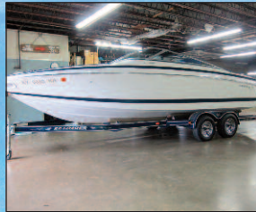
2001 Cobalt 246– 6.2MX BIII, White/Navy, Loaded w. Opt., EZ Loader Trailer

Check Out Our Great Pre-Owned Boat's Online! www.modernmarineonline.com