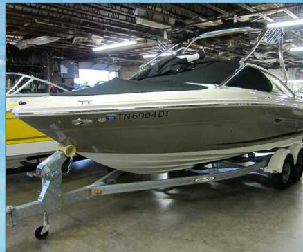
Used 2006 Sea Ray 200 - 5.0MPI(260)B3 Merc - Loaded with options!

Check Out Our Great Pre-Owned Boat's Online! www.modernmarineonline.com