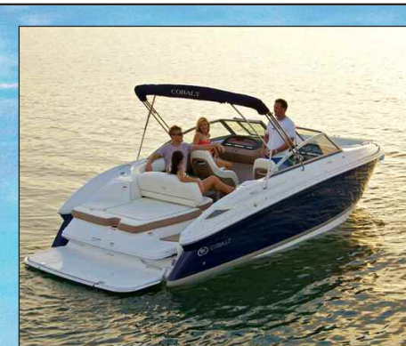
Used 2010 Cobalt 242-350MAG(300) B3 Merc - Like New